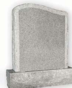
BS026 C1 Raised 1 Side, Pitched