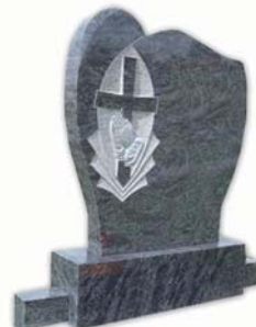
BS034 Bahama Blue Heart, Carved Cross Indent