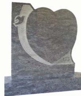
BS019 Heart Enclosed Headstone