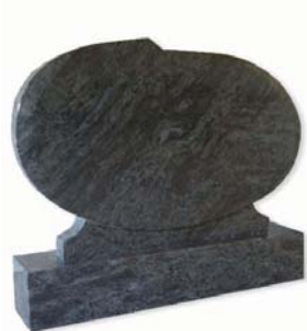
BS025 Bahama Blue Oval Ruby