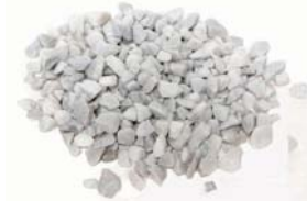
White Marble Headstone