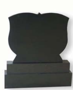
BS023 Black Angel