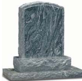
BS048 Green Granite Boulder Headstone