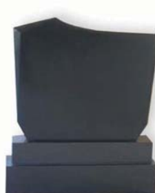
BS018 Black Murphy No. 5, Type 1