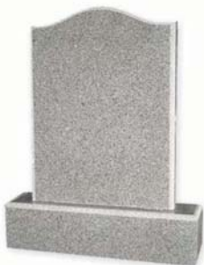
BS040 Curved Top, Pitched