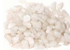
Natural White Marble P3 Size