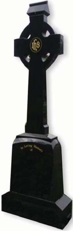
BS013 Polished Celtic Cross