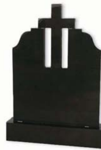
BS038 Cross Pediment Centre