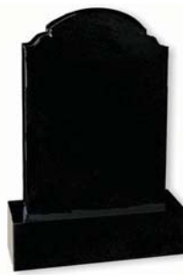
BS042 Black RTFS Headstone, Tall