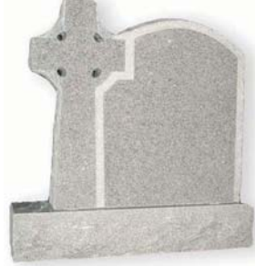
BS014 Cross Type 3