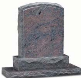
BS051 Granite Boulder With Pitched Top & Sides

In order to give you the widest possible choice, the headstones illustrated in this brochure are not to scale.