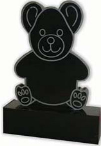
BS028 Black Teddy Bear