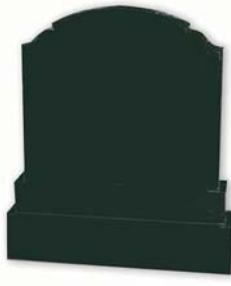
BS033 Black RTFS Wide