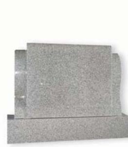
BS027 Wide Scroll