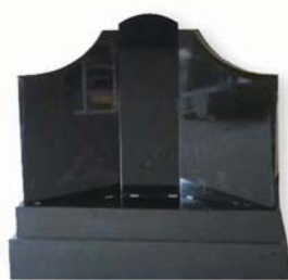
BS006 Black Gates, No Ledge