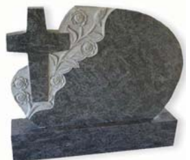
BS012 Bahama Blue, Carved Cross