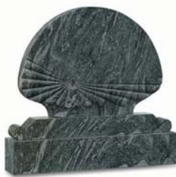
BS047 Green Granite Half Moon with Fan Detail