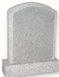
BS041 Round Top Headstone