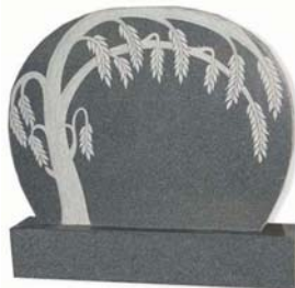
BS037 Tree of Life