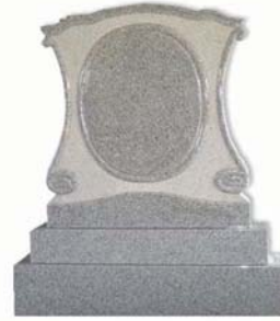
BS003 Framed Headstone