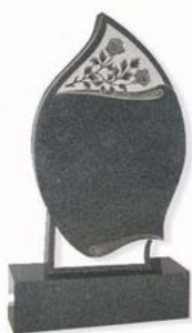
BS009 Curved Teardrop