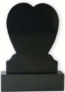
BS020 Black Heart