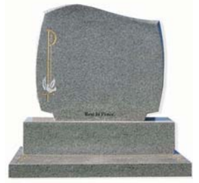
BS035 C2 Headstone