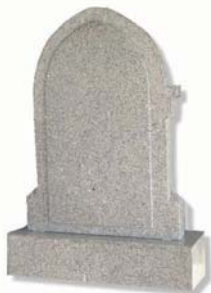
BS005 Grey Peaked Headstone