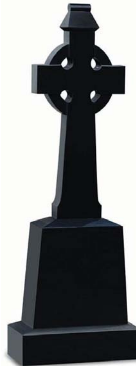
BS049 Granite Celtic Cross