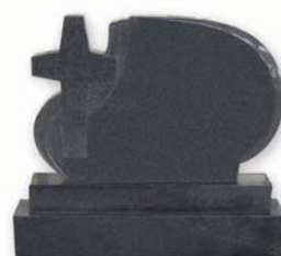
BS011 Bahama Blue Cross, Type 1