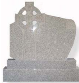
BS015 Cross Type 4