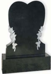
BS044 Heart With Carved Roses