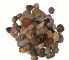
Small Mixed Pebbles

We at Butterly Stone provide all quantities of chippings. We are happy to advise you on the various options available for your grave plot together with the various rules and regulations applying to your cemetery.