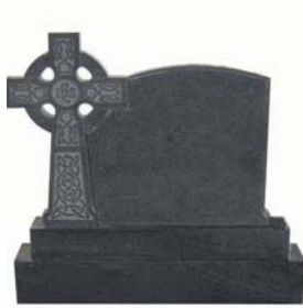
BS017 Bahama Blue Carved Cross