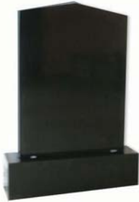
BS032 Black Apex