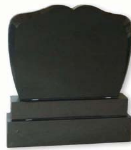
BS007 Black Butterfly