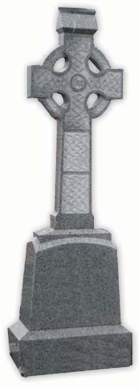
BS039 Carved Celtic Cross, Dyestone, Cap