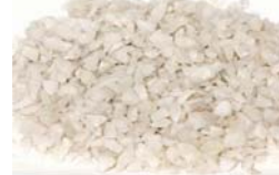
Natural White Marble P2 Size