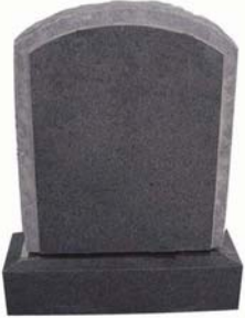
BS043 Boulder Stone Headstone