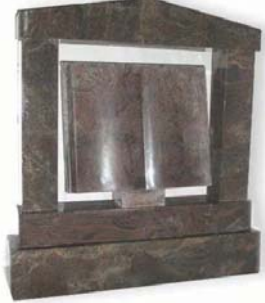
BS029 Bible, Square Columns