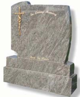
BS021 Baham Blue, Modern Murphy No. 5