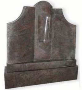
BS004 Gates of Heaven with Statue Ledge