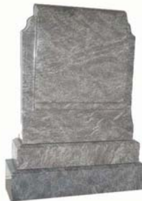
BS002 Bahama Blue, All Polished Scroll