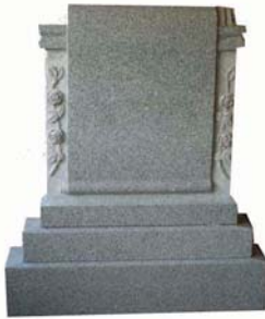
BS001 Scroll with Carved Roses