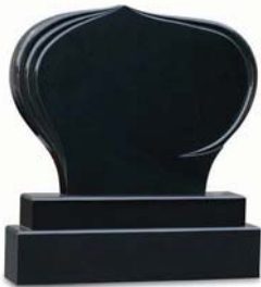
BS046 Oval Headstone With Fan Detail