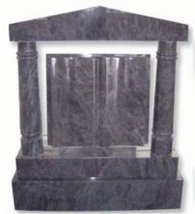
BS008 Bible with Curved Pillar Frame