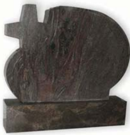
BS036 Cross Headstone Type 7