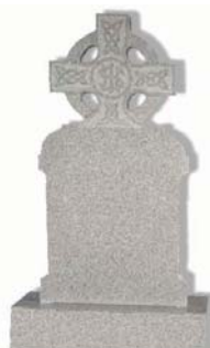
BS010 Celtic Cross Top Headstone