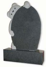
BS031 Teddy Bear Overhanging