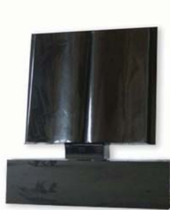
BS022 Black Bible