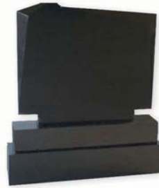
BS030 Murphy No.5, Type 3