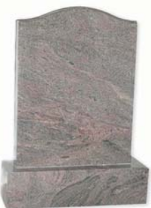
BS024 Curved Top Headstone