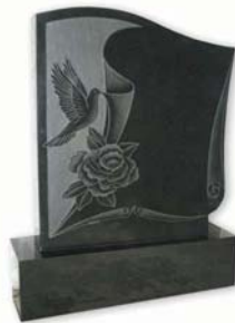
BS045 Shadow Blasted Dove