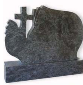
BS016 Bahama Blue 457, Type 5