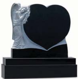
BS050 Black Granite Angel with Heart